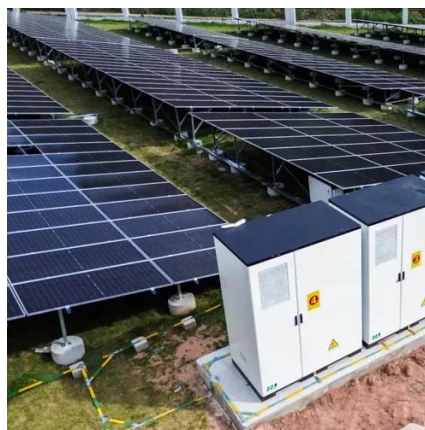
50KW modular power converter

Lithuania, officially the Republic of Lithuania, is a country in northern Europe. Situated along the southeastern shore of the Baltic Sea, it shares borders with Latvia to the north, Belarus to the ...